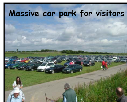
Massive car park for visitors