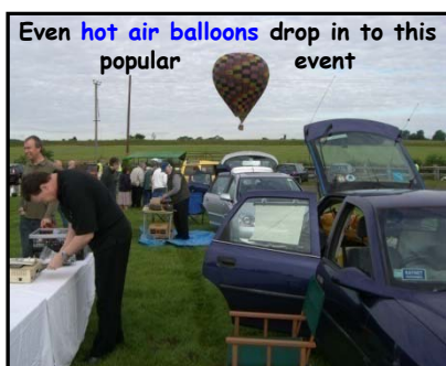
Even hot air balloons drop in to this popular event