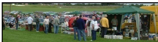
Traders and displays as far as the eye can see!