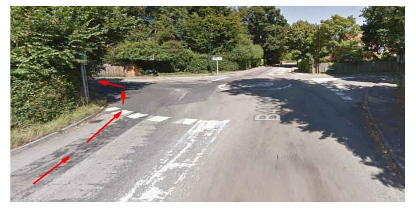
The diversions described in this document use Highways England recommendations. NADARS is not responsibility for the availability or suitability of these routes. Page 2 of 3